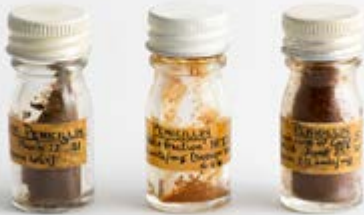
Early penicillin samples. Inv. 16920, 26401 & 14439.

Why not visit and find the perfect gift for a curious friend or an inspiring memento for yourself? We stock a range of bespoke gifts for the Back from the Dead exhibition, from cufflinks to notepads.