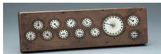
Early English adding machine, c.1780

Which is the earliest mechanical calculator you can see here?