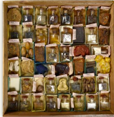
A tray from Thomas Dexter's Portable Museum, c. 1860, inv. 14976

From a medieval astrolabe to a 19th-century portable museum cabinet, we demonstrate the continued vitality of collecting in the modern museum, and the donations, grants and benefactors that make it possible.